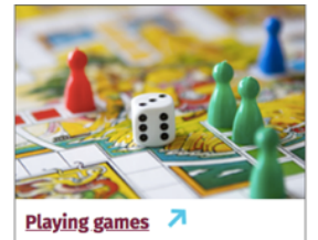
Playing games ↗

For further ideas and information go to https://nzmaths.co.nz/maths-our-house